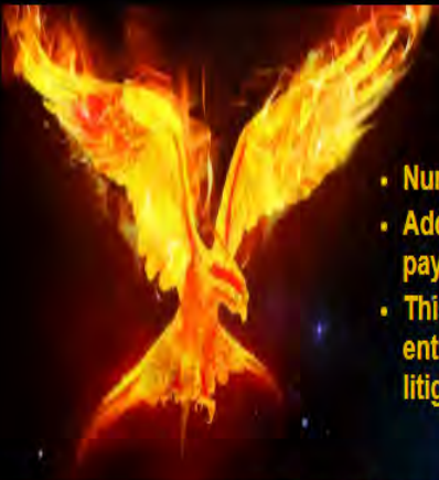
EXHIBIT #8 Issue-related website: https://sychoa.org/Legal-Stuff.html